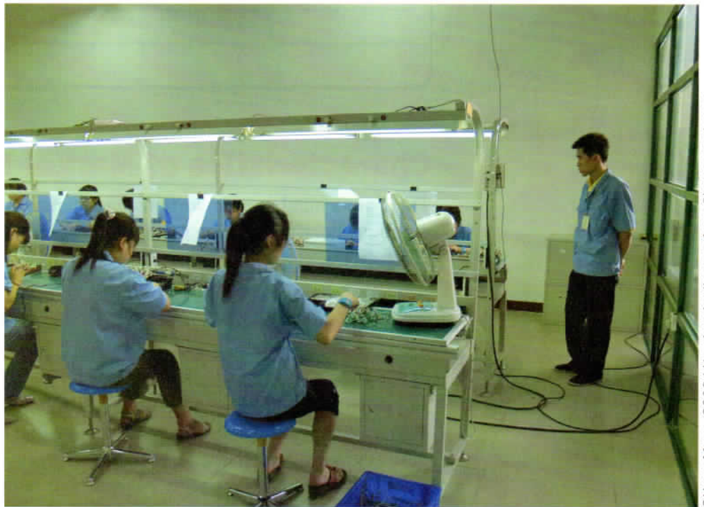
Who decides what products to make in a command economy?

In a command economy, the government owns the businesses and controls the economy. Officials, usually through central committees, make decisions on what and how goods are produced and how they will be shared. They decide how much resources will be spent on the military and how much will be spent on consumer goods. Government officials plan all phases of the economy and command that the plans be carried out. Citizens have little say on how the three key economic questions are answered, and people have limited freedoms.