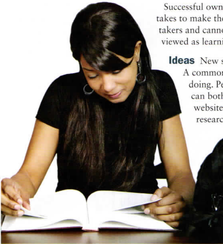
Why is it important to conduct research before starting a business?

Successful owners are also energetic and willing to do what it takes to make their own business a success. They must also be risk takers and cannot be afraid to make mistakes. Mistakes should be viewed as learning experiences.